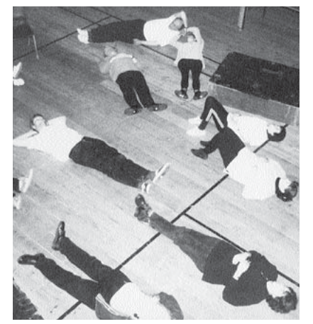
The cast collapses after a long dress rehearsal

Stepping Out Theatre is open to people who use and work in mental health services. Most of the participants appeared on stage for the first time in their lives last year after six months working on the production of "The Voyages of the Starship