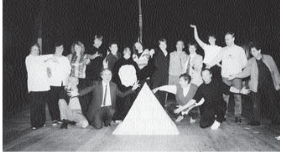
The cast of 'The Truth is out There - Somewhere'